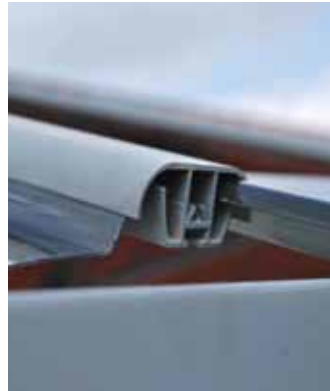
Sliding roof panel system