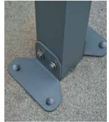
Anchoring kit included